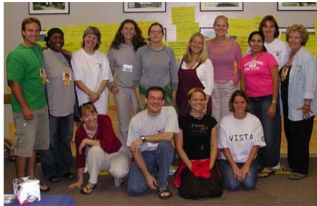
Emerging AmeriCorps*VISTA Change Masters at our annual In-Service Training in Gainesville, FL.

Who is a Change Master? Change Masters are individuals who help bring about change in an organization or community. These individuals can be anyone from a K-12 teacher, a student, to an AmeriCorps*VISTA member. It is the leadership of these individuals that