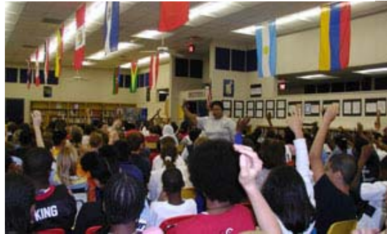
Fairview Middle Students share their thoughts on what it means to serve your community.

with community based-organizations and that there are no age requirements for volunteers. It was interesting, but not shocking, to find out that many students believe that community service is only for those who have done something bad or committed a crime and that trash pick-up is what many think of when they hear the words community service . Well, they now know otherwise. The students