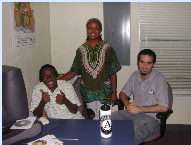
Peejay and Syrhedra with a student at the Digital Media Camp

"It is truly a powerful thing when people from all walks of life come together with one common, benevolent purpose."